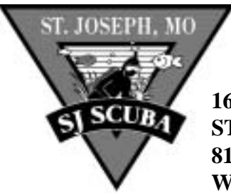
Check out our web site at http://www.sjscuba.com/Australia/Australia.htm

1601 S. 40TH ST JOSEPH, MO 64507 816-233-8344 WWW.SJSCUBA.COM